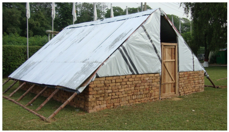
Figure 1.2 – Photograph of Similar Bamboo Shelter

The timber framed shelter consists of seven triangulated frames of sloping rafters forming a pitched roof of 43.8 degrees. These frames are connected using a ridge pole supported by two 2.74m high vertical columns at each end. The shelter is 4.27m x 5.72m on plan and has a 0.9m high, 215mm thick brick wall constructed inside the frame to prevent flood damage, provide warmth and to enable excavation below ground level.